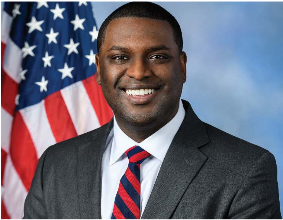
Rep. Mondaire Jones

With hundreds of thousands of undocumented, or illegal immigrants, crossing the US-Mexico border, on July 7, Westchester Congressman Mondaire Jones led 30 members of the Congressional Black Caucus in calling on the Biden Administration to return individuals unjustly deported from the United States. In their letter to President Biden and Homeland Security Secretary Alejandro Mayorkas, the lawmakers point out that the vast majority of unjust deportations have targeted Black and brown immigrants, and call on the Administration to establish a centralized process to evaluate and authorize returns going forward.