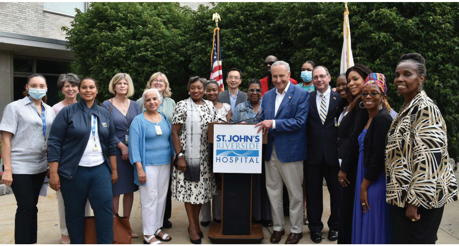
Senator Schumer, with State Senate Majority Leader Stewart-Cousins, St. John's Hospital staff and STSI members