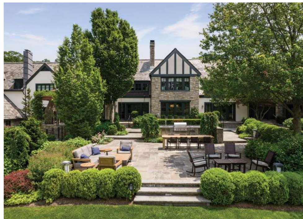
21 Stratford Road, Harrison, listed by Houlihan Lawrence for $11 million

Sales of luxury homes north of NYC in Q2 continued to post double- and triple-digit gains compared to Q2 2020, according to the Houlihan Lawrence Luxury Market Report released today.