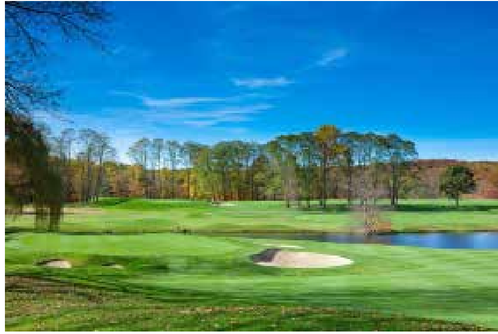
The 17th Hole at The Summit Club