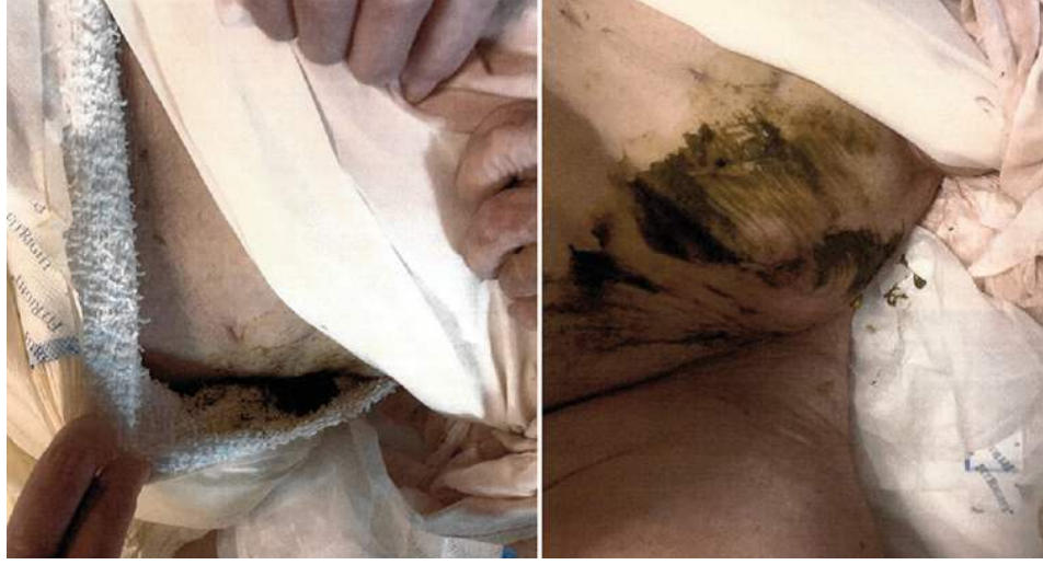
a photo of an unclean patient at Martine Nursing Home in WP

On June 28, New York Attorney General Letitia James filed a lawsuit against the owners, operators, and landlords of four nursing homes for years of repeated and persistent fraud and illegally misusing more than $83 million in taxpayer money that resulted in significant resident neglect, harm, and humiliation.