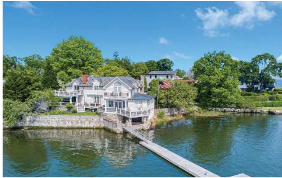
Home for sale at 522 The Parkway in Mamaroneck.

The real estate market in Westchester, Putnam, and Dutchess faced heightened challenges during the second quarter of 2023, characterized by low inventory levels and the impact of an abrupt increase in mortgage interest rates, according to the Houlihan Lawrence Westchester-Putnam-Dutchess Q2 Market Report released today.