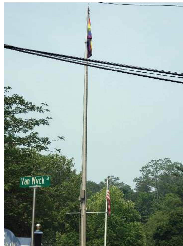
Pride Flag flying taller than the American Flag on July 4 at Croton Village Hall