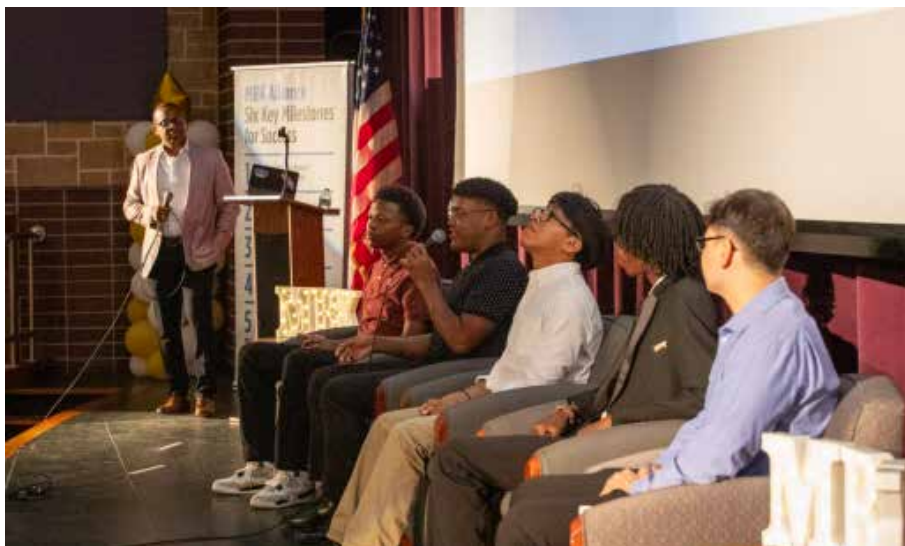
panel discussion with MBK alum and current students