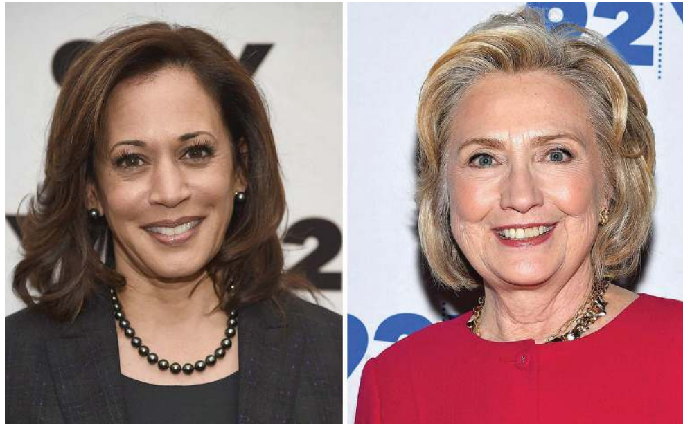
Vice-President Kamala Harris, left, and former Sec. of State Hillary Clinton

TV Internet Phone: Get DIRECTV! ONLY $69.99/month! 155 Channels & 1000s of Shows/ Movies On Demand (w/SELECT All Included Package.) PLUS Stream on Up to FIVE Screens Simultaneously at No Additional Cost. Call DIRECTV 1-888-534-6918.