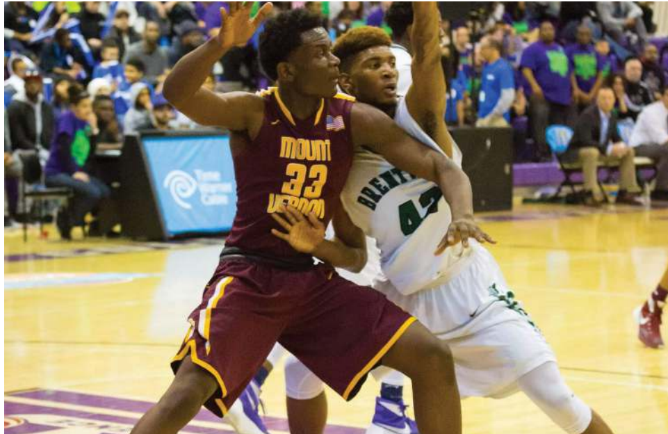
Mount Vernon's boys High School basketball team is scheduled to play

See some of the area's best high school basketball match-ups during the Slam Dunk Showcase on Sunday, January 9 at Iona College's Hynes Athletic Center in New Rochelle.