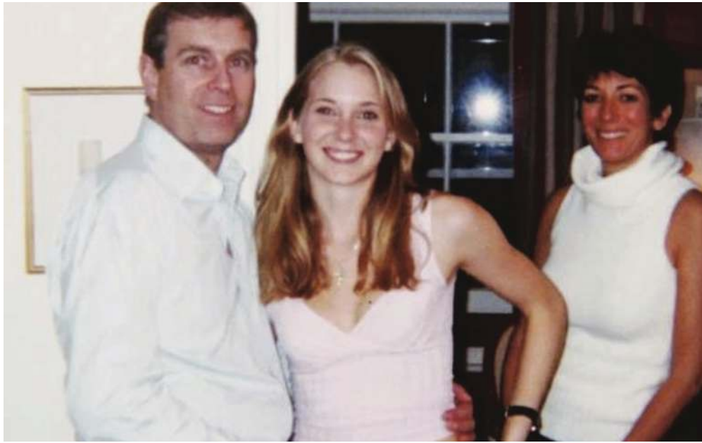
The picture that can't be explained: Prince Andrew, holding 17 year old Virginia Giuffre, with Ghislaine Maxwell, right