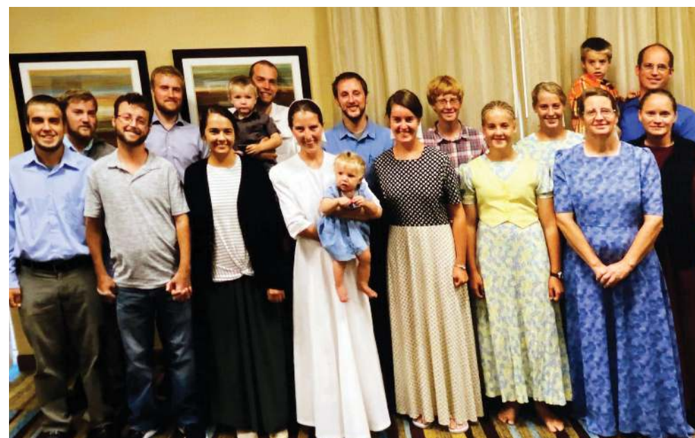
17 members from Christian Aid Ministries, CAM, that were held hostage in Haiti