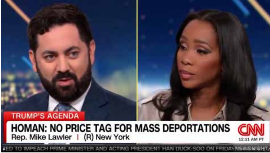
Rep. Mike Lawler with CNN Host Abby Phillip