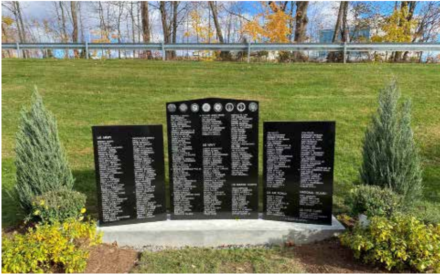
Mount Pleasant's Vietnam Veterans Memorial.

The Town of Mount Pleasant invites residents to honor their loved ones who have served in the United States military through its 2025 Military Tribute Banners program.