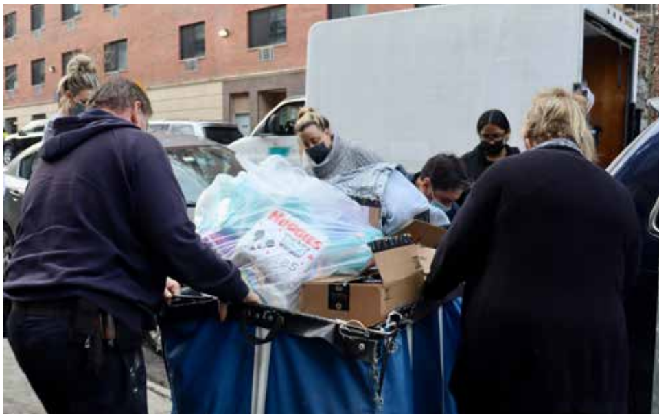
Donation Drive Took Place at County Office Building, Social Services District Offices and Public Safety

Westchester County employees came together after learning of the devastating fire in the Bronx on January 9, claiming the lives of 17 people, including 8 children. Donation boxes were set up at the Michaelian Office Building, district offices of the Department of Social Services and Department of Public Safety Headquarters. The weeklong drive that took place from January 14-21, garnered more than 800 pounds of donations including diapers, blankets, pillows, clothes, toiletries and non-perishable food.