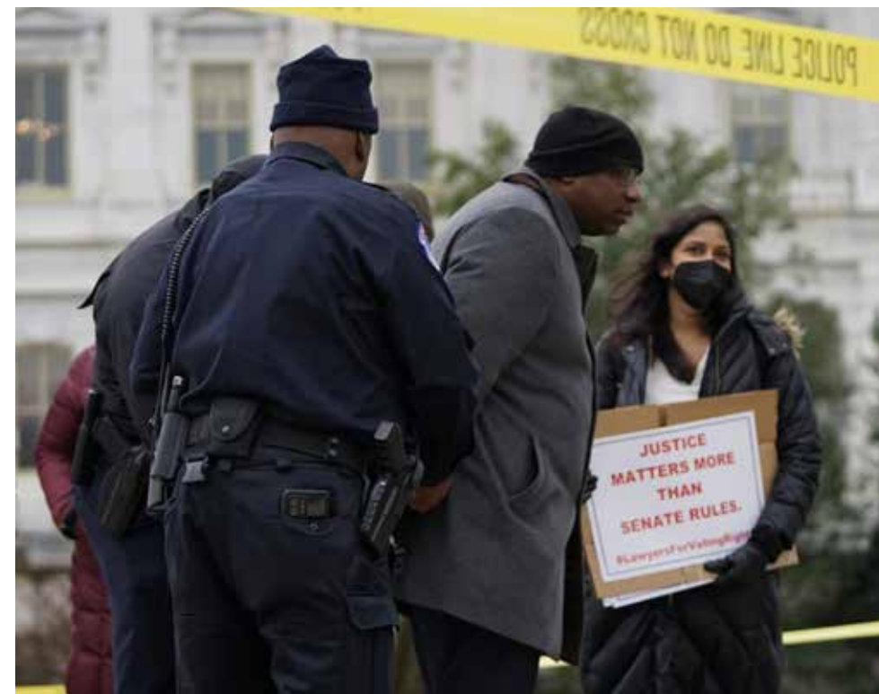
Congressman Jamaal Bowman, placed under arrest at the U.S. Capitol on Jan.