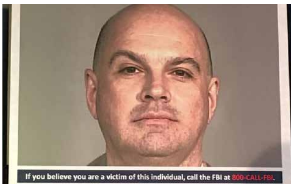
If you believe you are a victim of this individual, call the FBI at 800-CALL-FBI.