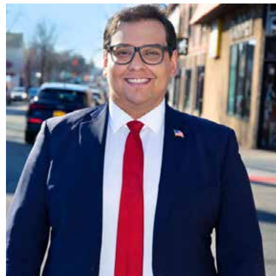
Congressman George Santos

Rep. Lawler Calls for Rep. Santos to Resign