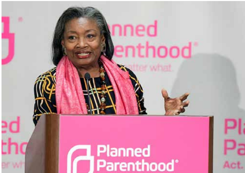
State Senate Majority Leader Andrea Stewart-Cousins