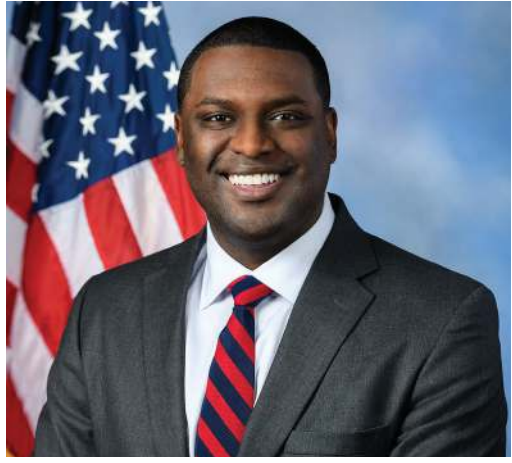
Rep. Mondaire Jones

Students grades 6 -12 in New York's 17th Congressional District should submit videos reenacting their favorite moment in Black history for a chance to win