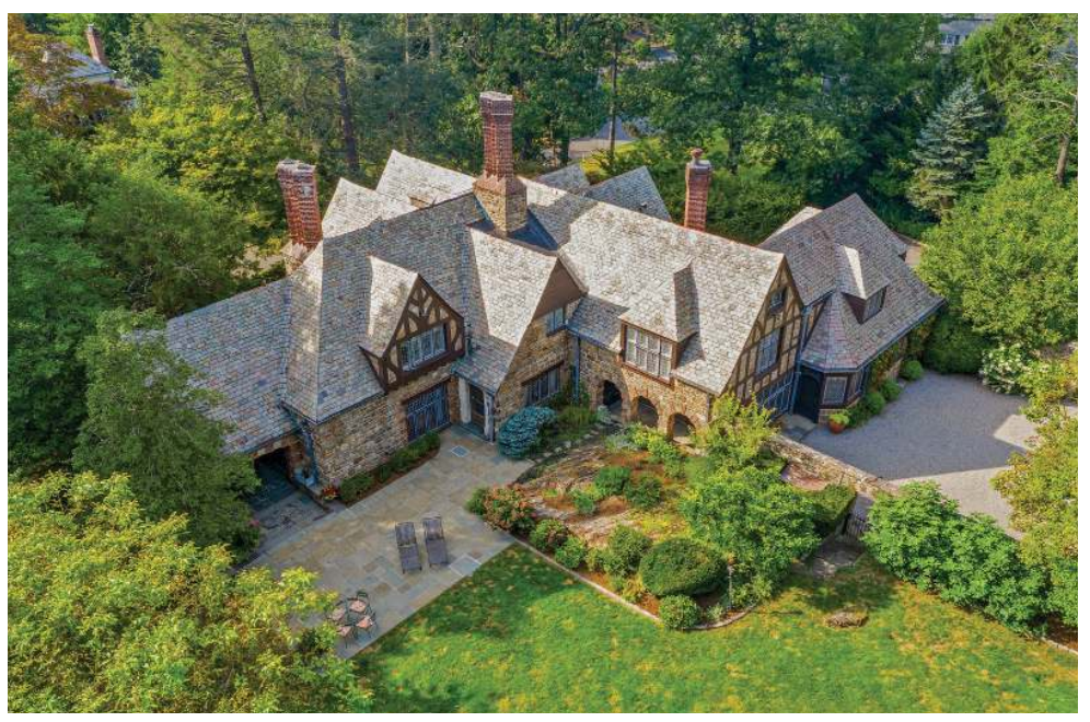
6 Beechwood Road, Bronxville home for sale at $5.5 M & $132,115 in property taxes

Low Inventory and High Demand Make 2021 A Record Breaking Year for Westchester Home Sales