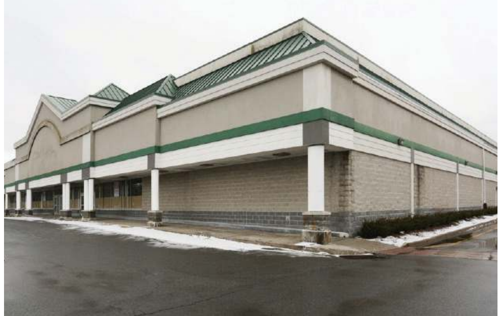
long vacant supermarket in Yorktown in old K-Mart shopping center will be filled