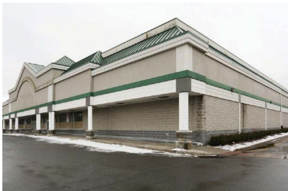
long vacant supermarket in Yorktown in old K-Mart shopping center will be filled