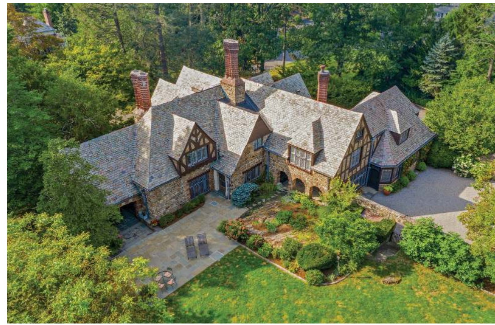
6 Beechwood Road, Bronxville home for sale at $5.5 M & $132,115 in property taxes

Building on the sales surge in 2020, single-family home sales posted a record-breaking year in 2021 fueled by low inventory and strong buyer demand, according to the Houlihan Lawrence Westchester-Putnam-Dutchess Q4 Market Report released today.