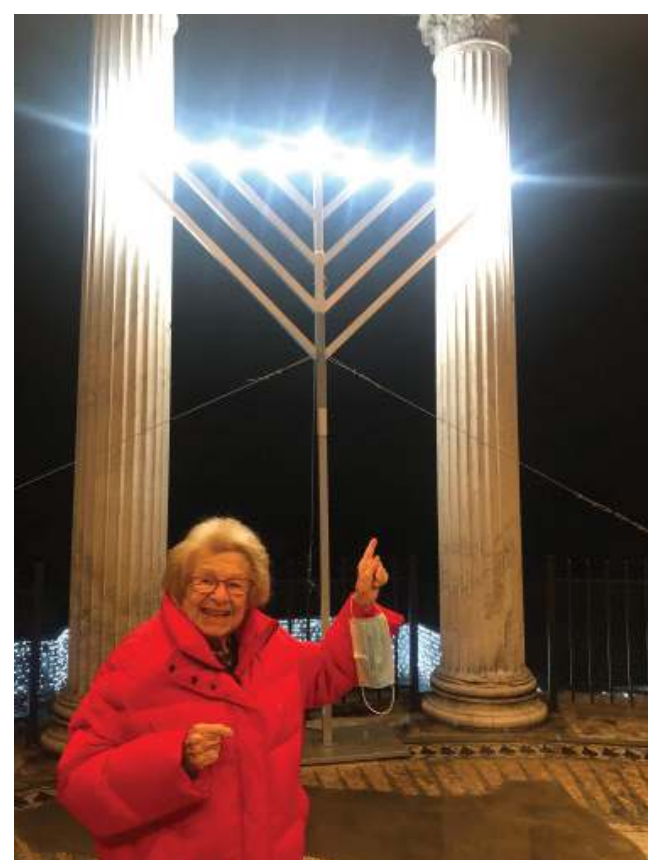
Dr. Ruth Westheimer, enjoying the Grand Illumination at Untermyer Gardens, Yonkers