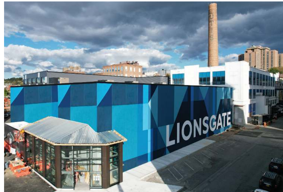
Lionsgate Studios has opened its new $100 Million TV-Movie Studios in downtown Yonkers, and has immediately agreed to a Half-Billion Expansion. See story on pg 6-