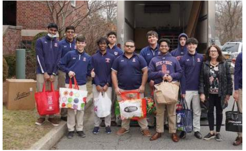
Stepinac's students who participated in last year's SOUPER Bowl Food Drive.

Continuing a 12-year tradition, Stepinac High School students are mobilizing their efforts in the school's single largest annual food drive, known as the SOUPER Bowl, to help Feeding Westchester meet its critically important mission.