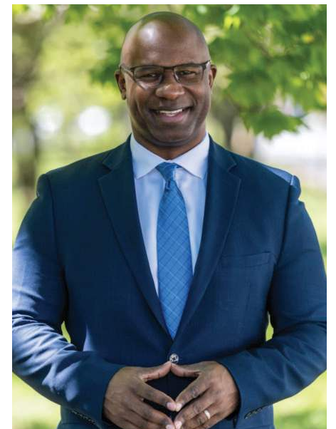
Congressman Jamaal Bowman