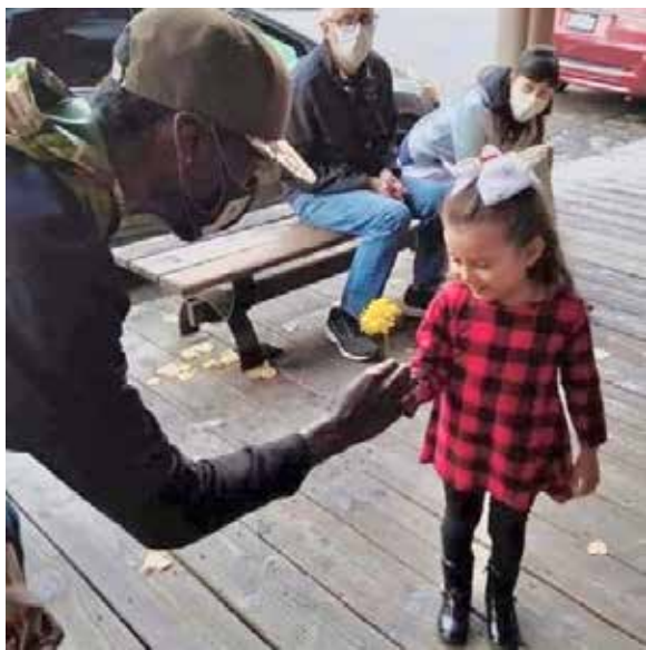
a photo circulating on social media of Tyre Nichols giving a flower to a young girl