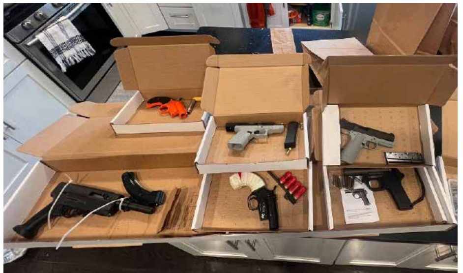
Some of the Ghost Guns found by Westchester County & Lewisboro Police