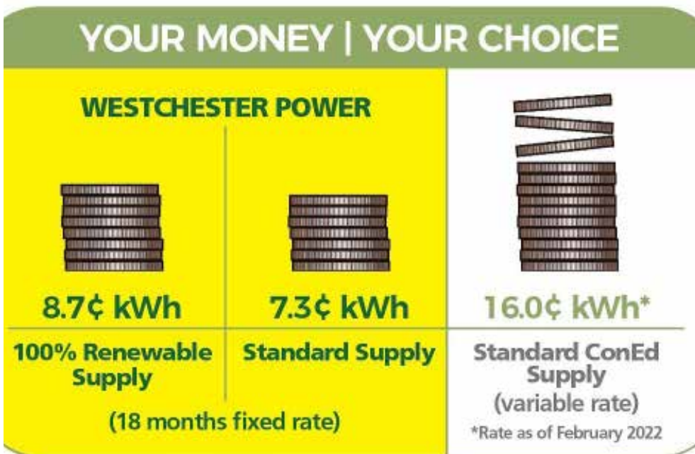
A comparison of Green Energy Rates to Con Edison Rates, before their proposed increase show that Green is currently less expensive