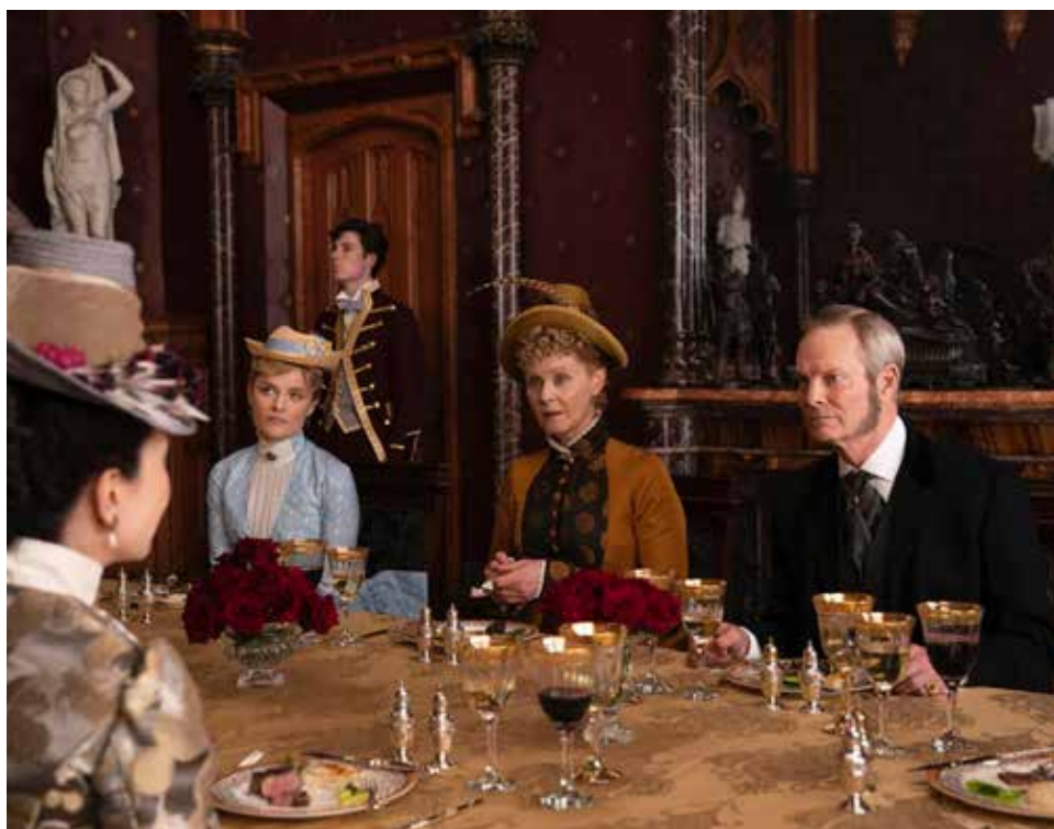
Filming of HBO's The Gilded Age at Glenview Mansion at the Hudson River Museum in Yonkers, above, and at Lyndhurst in Tarrytown, below