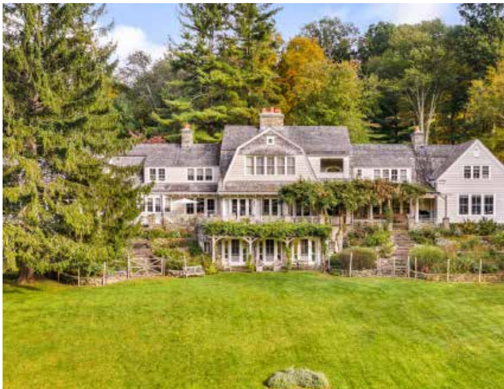
Above: Richard Gere's Pound Ridge Home for sale at $28 Million Below: Gere's new home in North Salem that he bought for $9.9 M