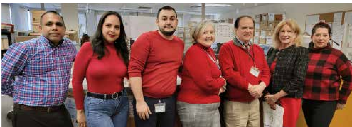
18th year celebrating American Heart Month

The office of the Westchester County Clerk has once again come together to celebrate American Heart Month by wearing red for women on national Go Red for Women Day, Friday February 3, 2023. Dozens of staff members arrived at work with bright red outfits and spoke to all who visited the office of the importance of the day and thinking about their heart health.