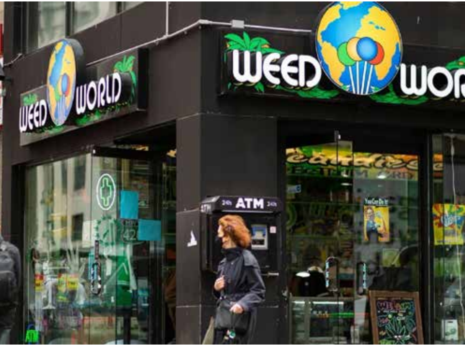
some stores in New York City and Yonkers have been selling marijuana before obtaining a license to do so legally