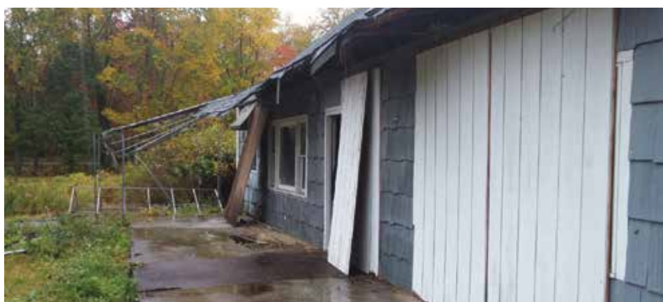
Dilapidated Clubhouse from 2014 and RC Renovated Clubhouse today.