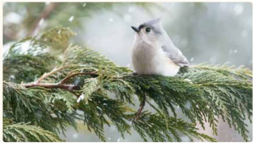
Tufted Titmouse.

The nation's longest-running community science bird project fuels Audubon's work throughout the year. The Christmas Bird Count occurs December 14 to January 5 every season. Sign up to receive information and results about all of Audubon's community science programs through American Birds, our email newsletter.