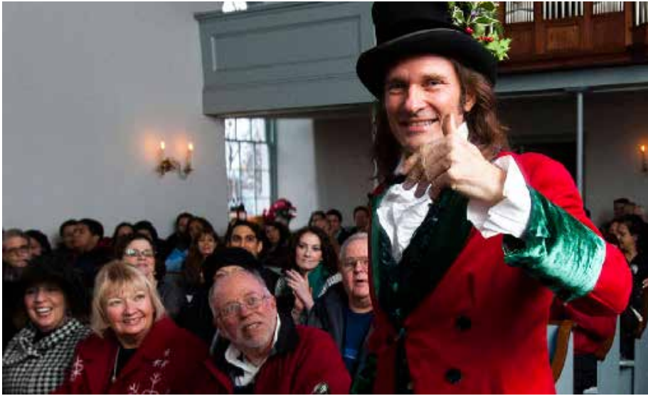
"There is nothing in the world so irresistibly contagious as laughter and good humor." – Charles Dickens, A Christmas Carol