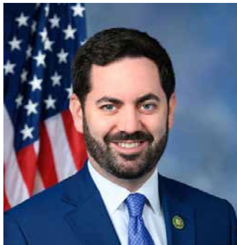
Congressman Mike Lawler