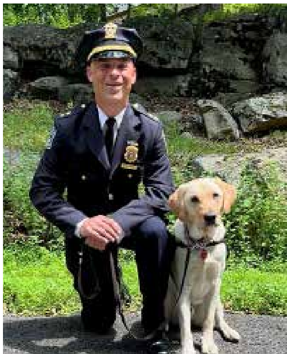
Police Dog Helps Victim to Testify