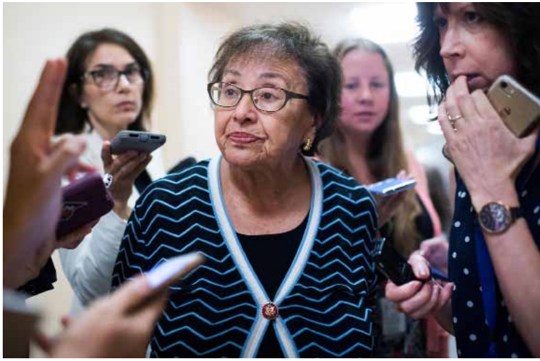
'Westchester's Congresswoman' Nita Lowey