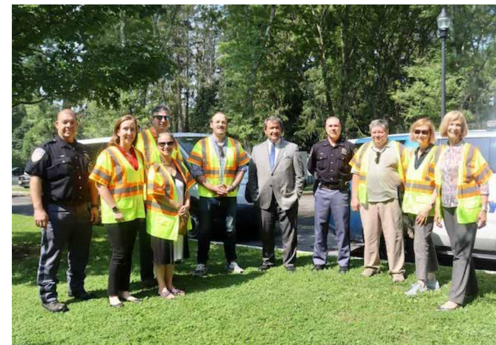
members of the wrong way task force with County Executive George Latimer and members of the Westcheter County Police

The "Wrong Way Task Force" made its first trek along the southbound Bronx River Parkway, after a brief pause during the height of the COVID-19 pandemic. Made up of Westchester citizens and elected officials, the group began at the Kensico Dam Plaza in Valhalla and made their way to Yonkers reviewing the signage and messaging along the County owned and patrolled Bronx River Parkway.