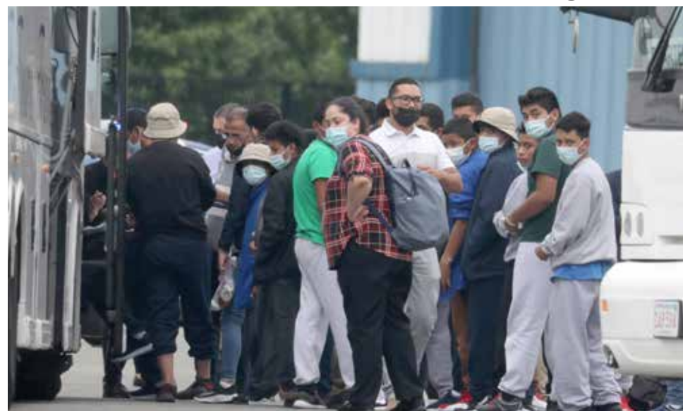
undocumented minors boarding buses at the Westchester County airport