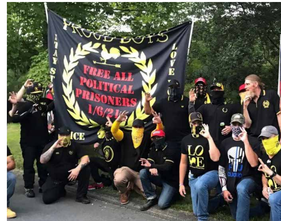
members of the Proud Boys, posing for the camera outside of NY GOP fundraiser featuring former President Trump in Briarcliff Manor