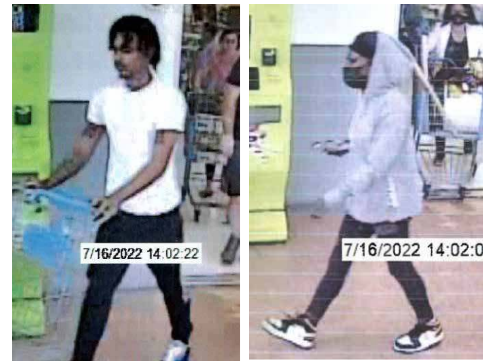
two suspects seen walking out of Walmart, Cortlandt Manor with unpaid merch

Two Suspects Walk Out of Walmart Cortlandt Manor With $3,244 in Merchandise