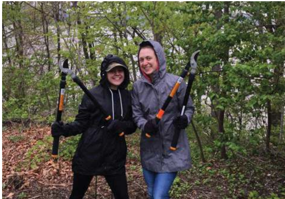
Weeklong Event Takes Place Throughout Westchester April 18 - 23

Westchester Parks Foundation is seeking volunteers of all ages for Pitch in for Parks, its largest volunteer program. The annual event, held in partnership with the Westchester County Parks Department, will take place throughout Westchester from Monday, April 18 through Saturday, April 23, rain, or shine. This year the event is made possible by Gold Sponsor Triton International. Pre-registration is required.