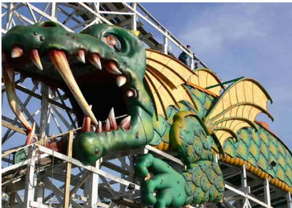
Playland's historic Dragon Coaster