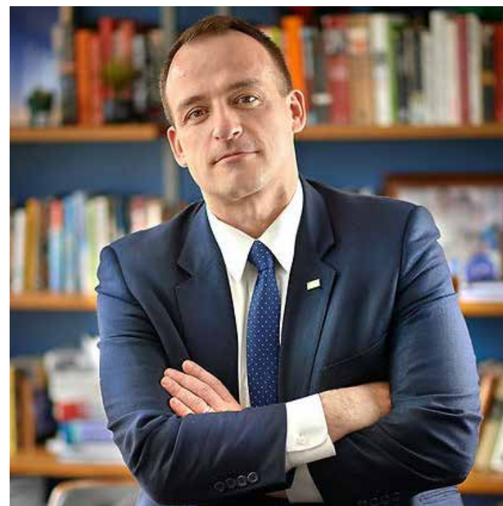
County Legislator and Congressional candidate Vedat Gashi