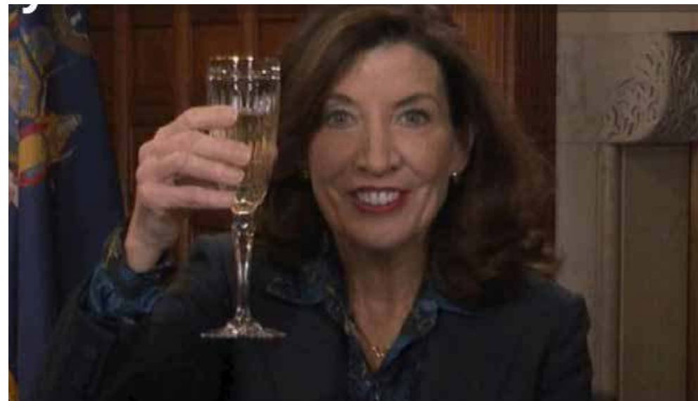
Gov. Kathy Hochul, celebrating "Drinks to go" in the NYS budget

On April 8, a $220 Billion New York State budget was agreed to by Governor Kathy Hochul, State Senate Majority Leader Andrea Stewart-Cousins and Assembly Speaker Carl Heastie. The budget, which was adopted one week late, calls for changes that Hochul wanted to bail and criminal justice reform, a 16 cent per gallon gas tax repeal, more funding for child care subsidies, $600 million for a new stadium for the Buffalo Bills, and three casino commercial licenses, one of which is believed to be for MGM Casino -Yonkers Raceway, which would allow full scale gaming and a sports book.