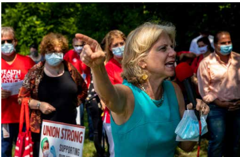
Westchester State Senator Shelley Mayer