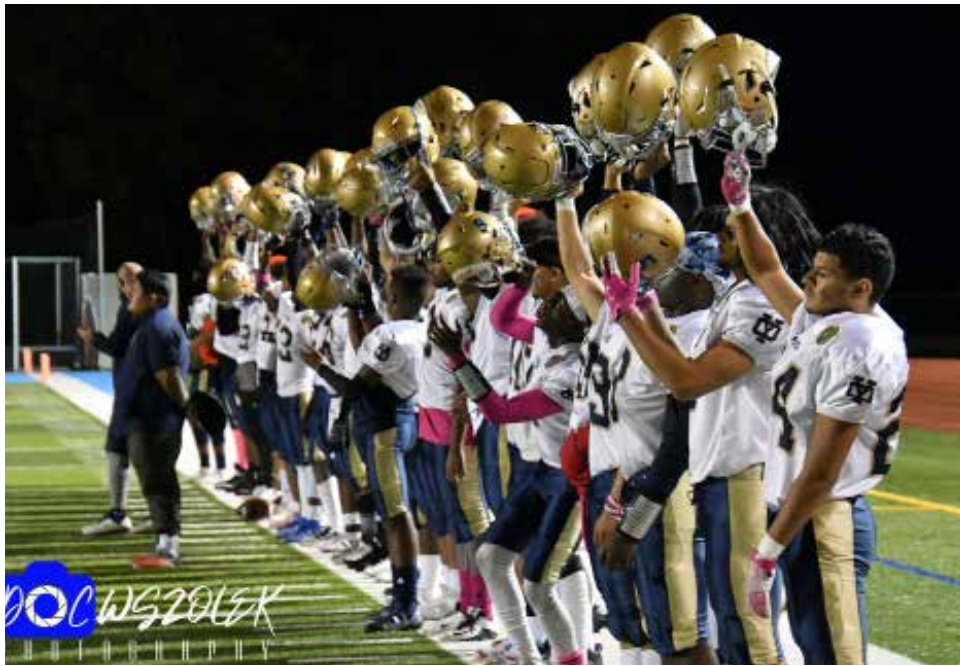
Congratulations to the Yonkers Force Football team