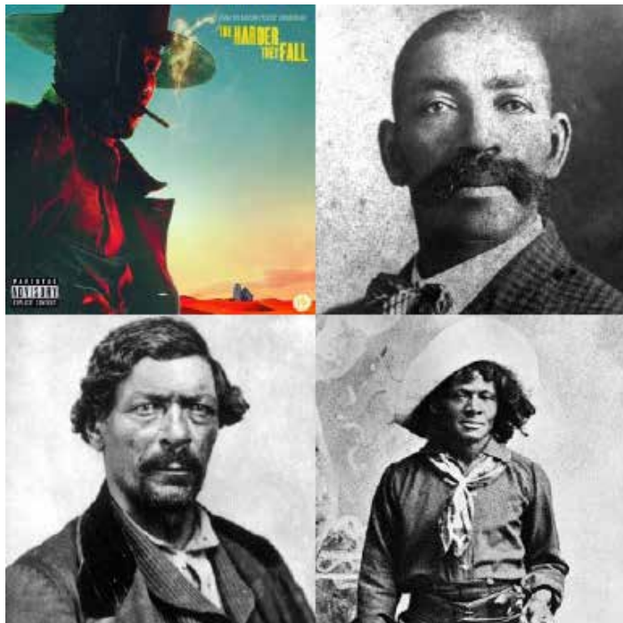
Top right, Bass Reeves, bottom right Nat "Deadwood Dick" Love, bottom left James "Bloody Arm" Beckwourth