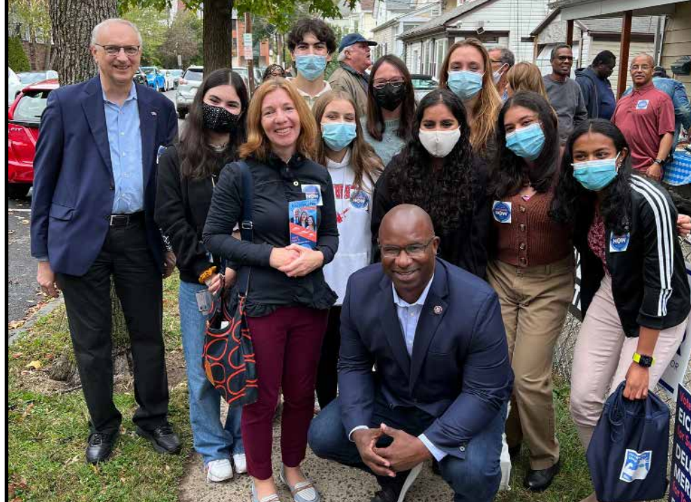
Congressman Jamaal Bowman, kneeling, campaigning in Eastchester

In an exclusive interview with Yonkers Rising-YonkersTimes.com, Westchester congressman Jamaal Bowman defended and explained his no vote on the $1.2 Trillion Infrastructure bill which narrowly passed the House and will now be signed by President Joe Biden.