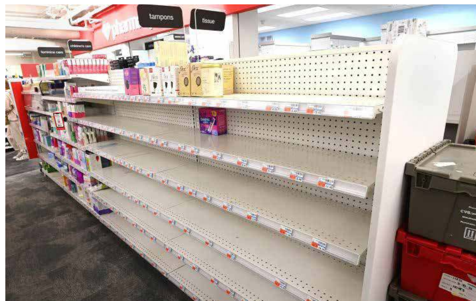
some Yonkers pharmacies have empty shelves due to "Organized Retail Crime"