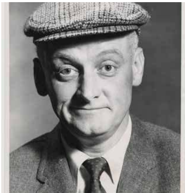
Yonkers resident Art Carney