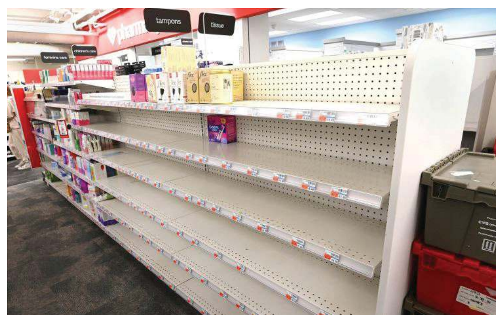
some Westchester pharmacies have empty shelves due to "Organized Retail Crime"

Empty Shelves at Some Drug Stores Bail Reform-Repeat Offenders Blamed