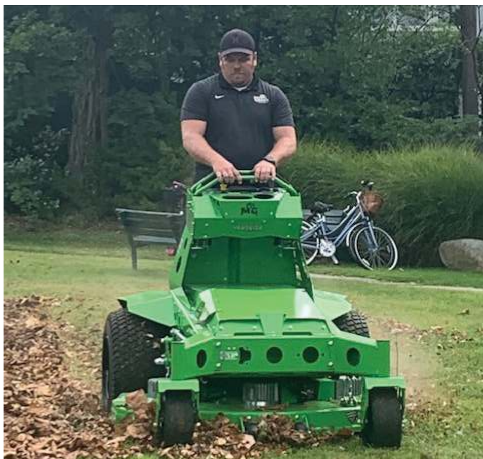
Electric equipment demonstration in Larchmont

In the Fall of 2020, the Village of Larchmont passed a landmark code, effective January 1, 2022, that entirely bans the use of gas-powered leaf blowers and restricts the use of electric leaf blowers to spring and fall clean-up periods. Larchmont is taking sustainable landscaping several steps further by encouraging mulch mowing; forgoing chemical pesticides, herbicides and fertilizers; and using native trees and plants in landscaping municipal properties. Larchmont's Green Zone demonstrates that properties can be well-maintained without the use of fossil fuel-powered equipment.