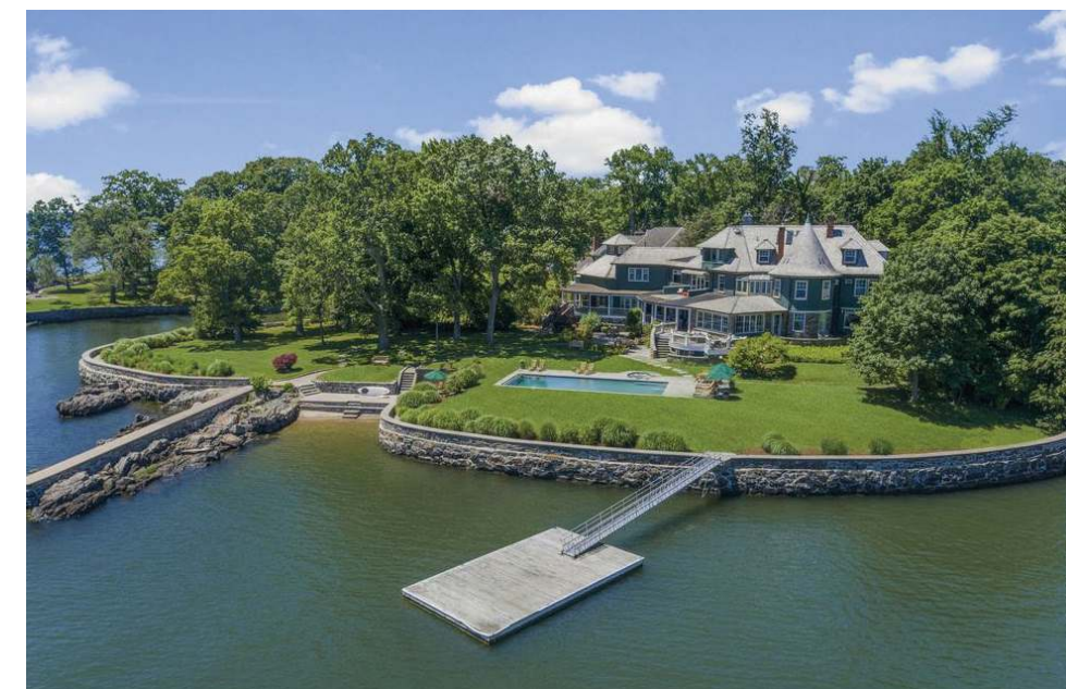
Larchmont home at 25 Park Avenue on Long Island Sound