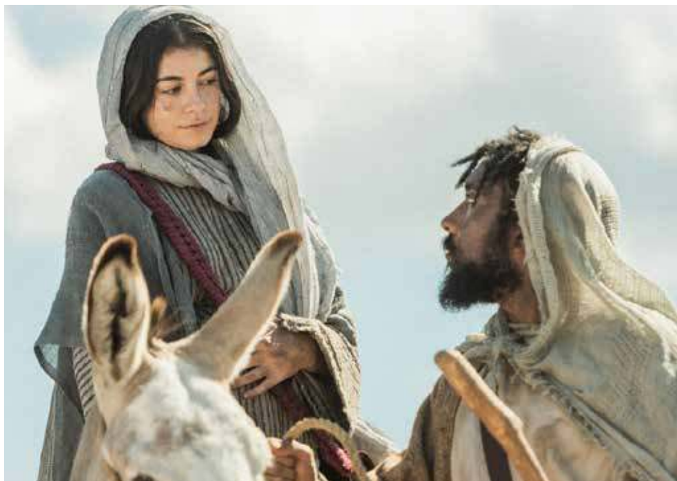
Mary and Joseph from Christmas With The Chosen

The box office success of “Christmas With The Chosen: The Messengers,” shows that there is “room at the Inn” for a religious movie that follows the events surrounding the birth of Jesus from the perspective of Mary and Joseph, and that americans will step out of their living rooms and return to the movie theater for a special event.