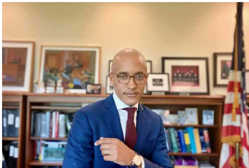
US Attorney, SDNY, Damian Williams

On Dec. 3, the Mt. Vernon Police Department now has the unfortunate distinction to be named with police departments in Minneapolis, Phoenix and Louisville, as being under federal investigation for violations including use of force, illegal strip search, and mishandling evidence. Two branches of Federal law enforcement announced the investigation into the Mt. Vernon PD: U.S. Attorney for the Southern District of NY, Damian Williams, and Assistant Attorney General for Civil Rights Kristen Clarke.