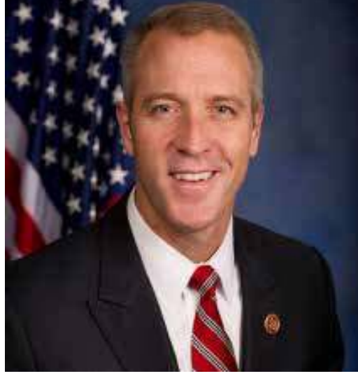
Northern Westchester Congressman Sean Patrick Maloney

Westchester County's third member of Congress, Rep. Sean Patrick Maloney said last week that he was confident that changes to the State and Local Tax Cap, (SALT) made in the House of Representatives will pass the U.S. Senate by the end of the year and become law, helping Westchester homeowners deduct larger portions of their property tax bills.